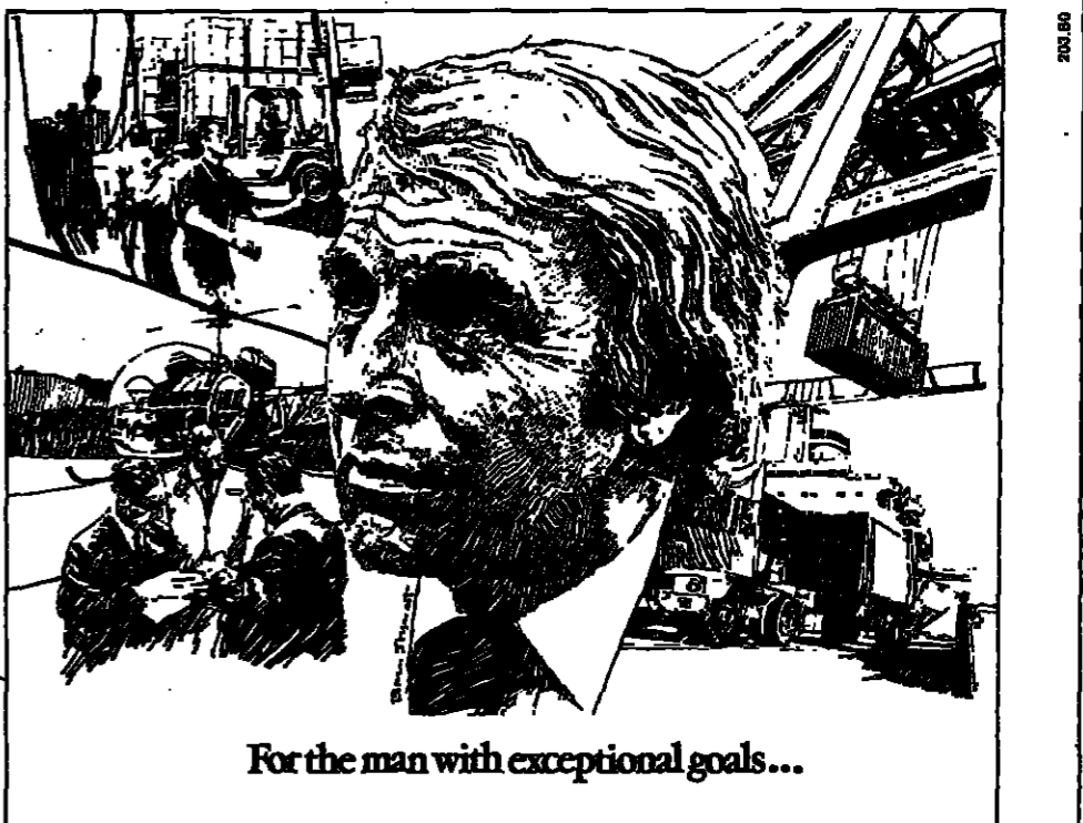
For the man with exceptional goals...